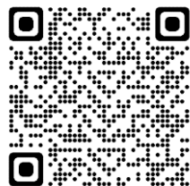
Scan the QR code for this and other prayer resources.

If you are unclear about the Gospel, we would be delighted to share it with you. Please ask any of us to explain it.